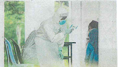
KAKITANGAN KKM merobuat pemeriksaan suhu badan ke atas individu untuk menjalani pemeriksaan saringan Covid-19 di Masjid Shelkh Haji Ahmad, Taman Nusari Aman, Sendayan.