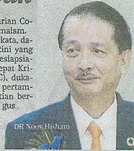
DR NOOR HISHAM

Dr Noor Hisham berkata, daripada maklumat terkini yang dilaporkan ke Pusat Kesiapsiagaan dan Tindakan Cepat Krisis Kebangsaan (CPRC), ducita dimaklumkan ada pertambahan satu kes kematian berkaitan Covid-19, sekali gus jumlah keseluruhan angka korban sebanyak 83 orang atau 1.64 peratus.