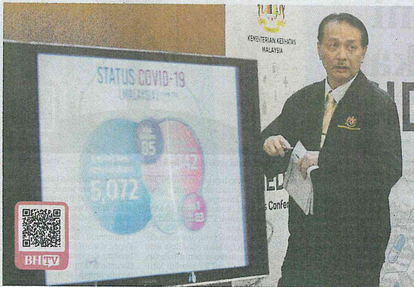
Dr Noor Hisham pada sidang media harian perkembangan COVID-19 di KKM, Putrajaya, semalam.