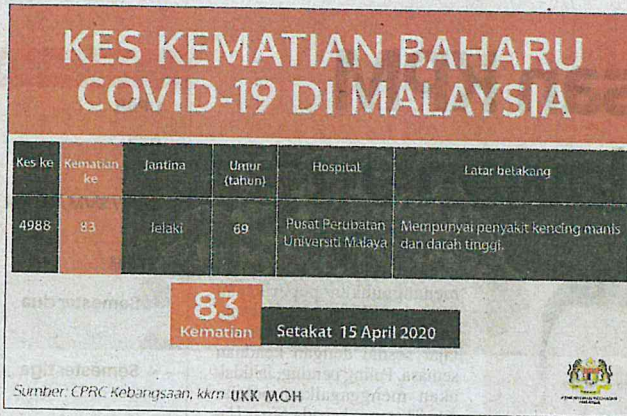
Satu lagi kematian akibat Covid-19 direkodkan di Malaysia semalam.

Untuk rekod, kali terakhir negara mencatatkan kes baharu positif Covid-19 di bawah angka 100 adalah pada