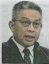
DR ADHAM BABA

"Langkah ini juga sangat bertepatan serta selari dengan matlamat kerajaan dan KKM untuk