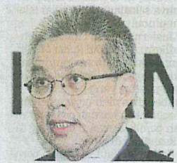
Dr Adham Baba

Dr Adham berkata, penyambungan itu membolehkan petugas kontrak perkhidmatan berakhir secara berperingkat pada akhir