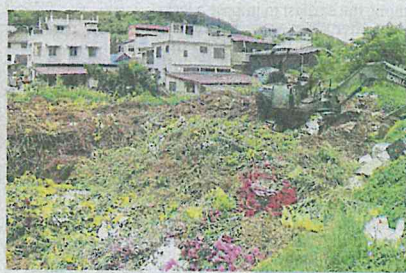
Win and lose: While vegetable growers get help from NGOs and politicians, flower producers have had to discard up to RM40mil in flowers (above) due to the pandemic.

"Four months ago, we planted double the amount of flowers for the Tamil New Year that fell on