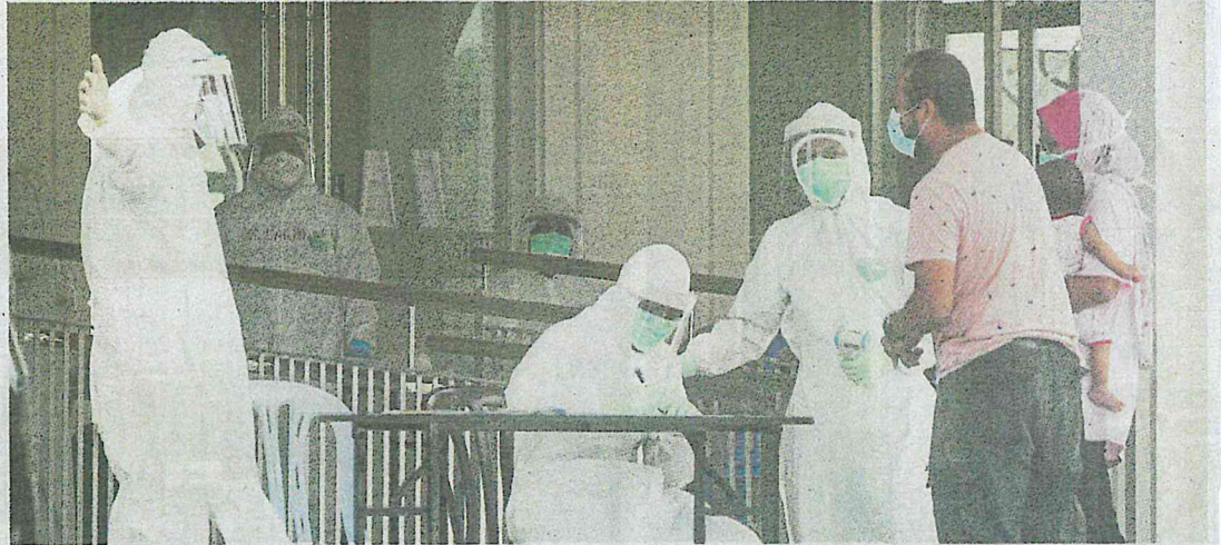
Kakitangan KKM melakukan ujian saringan COVID-19 terhadap penduduk Taman Nusari Aman, Sendayan, semalam.

Kes sporadik COVID-19 ialah kes yang tidak diketahui dari mana asal-usul jangkitan, tetapi ia sangat sedikit.