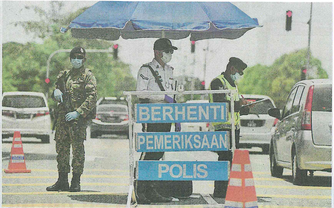
Police and armed forces personnel manning a roadblock in Labuan yesterday.

"Spraying such substances can be harmful to clothes or mucous membranes such as eyes and mouth," a posting on WHO's Facebook page read.